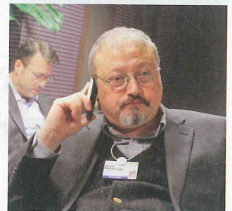
Khashoggi's fate Muhammad bin Salman is starting to look like an old-fashioned Arab despot: leader, page 14. If Jamal Khashoggi was murdered, it would be a chilling escalation by an increasingly repressive Saudi state, page 45