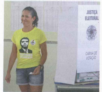
Brazil Jair Bolsonaro, a far-right populist, is poised to win the presidency, page 33. Brazil's soldiers are not itching for power—they may even act as a restraint on a militaristic president: Bello, page 34