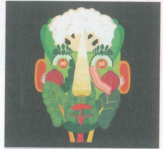
Rampaging vegans People in rich countries are eating a lot more plant-based food. The further they go, the better, page 23